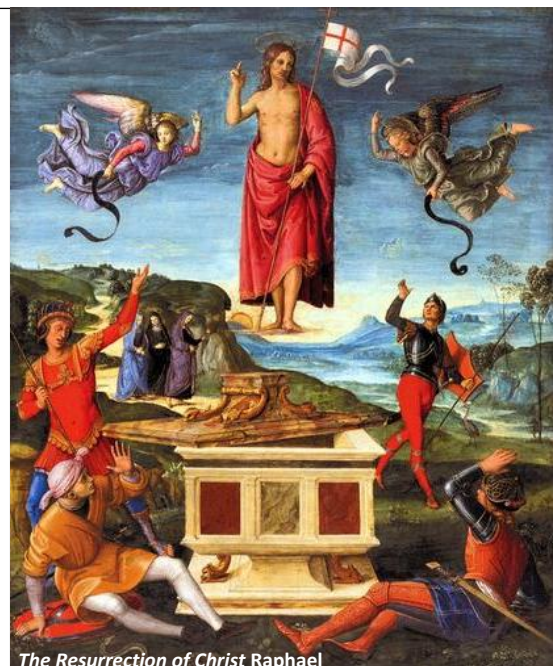
The Resurrection of Christ Raphael

Recessional Jesus Christ Is Risen Today (GA 361)